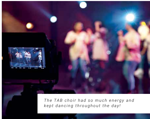
The TAB choir had so much energy and kept dancing throughout the day!