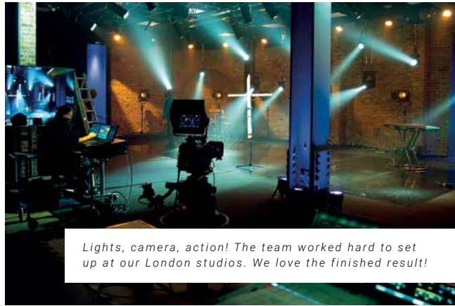
Lights, camera, action! The team worked hard to set up at our London studios. We love the finished result!